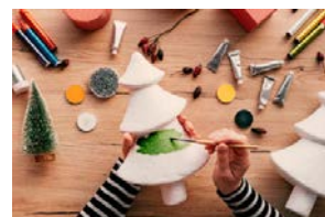
Making Christmas Decorations