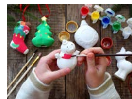
Crafting Christmas Ornaments