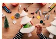
Making Christmas Decorations