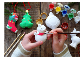
Crafting Christmas Ornaments